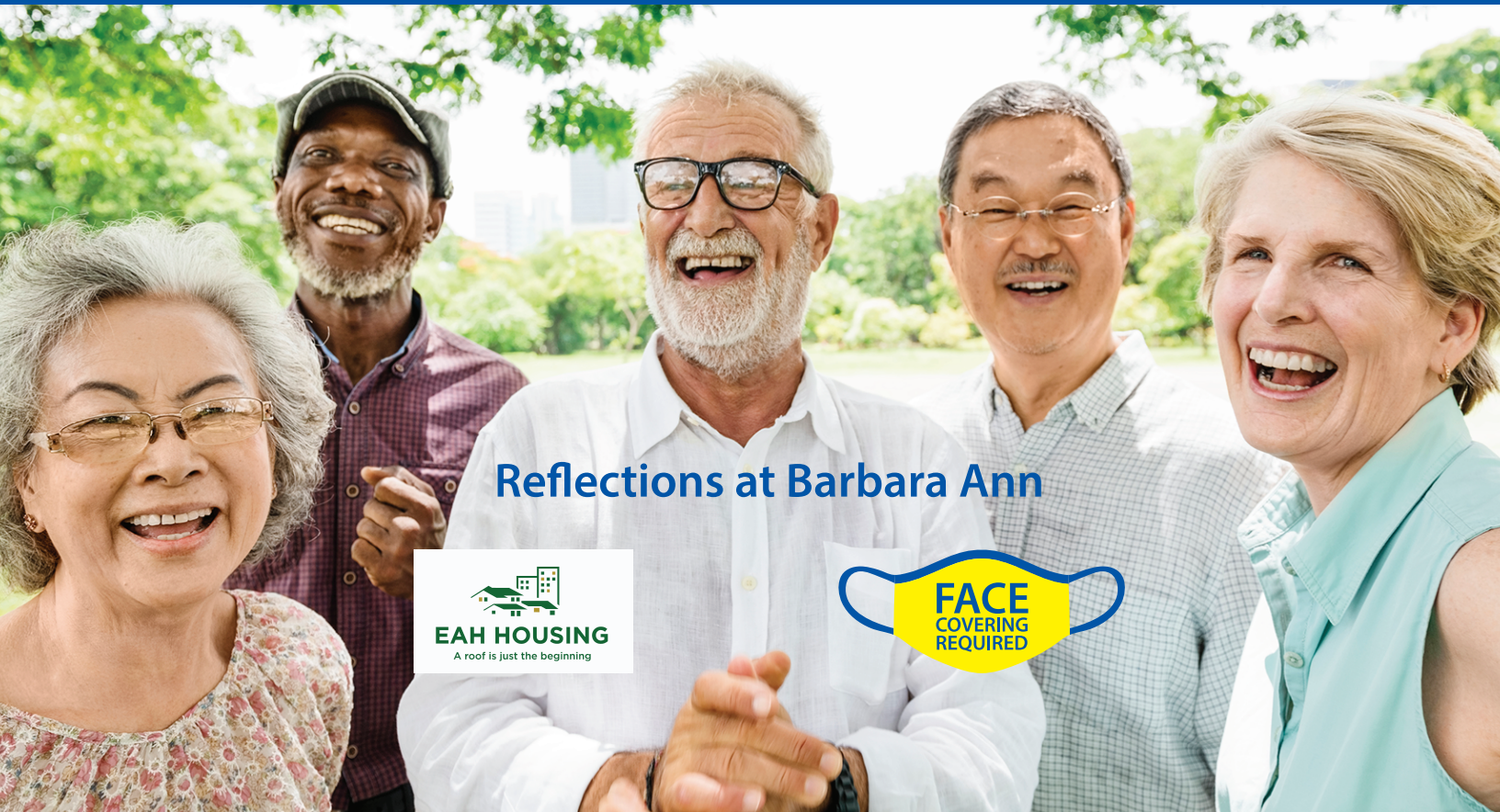
Reflections at Barbara Ann