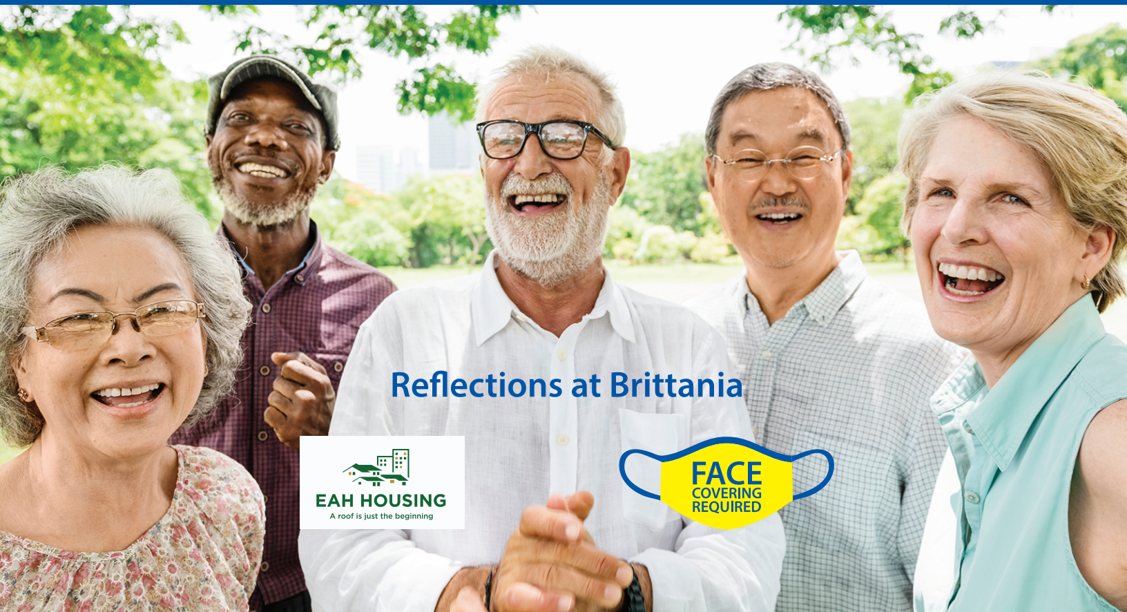
Reflections at Britannia